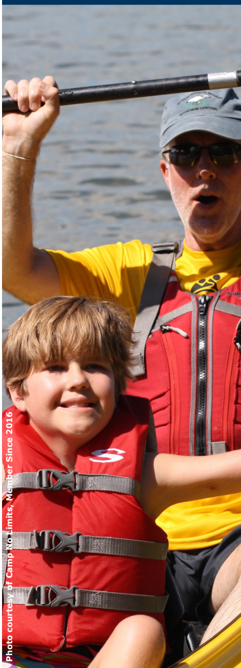
Member Since 2016